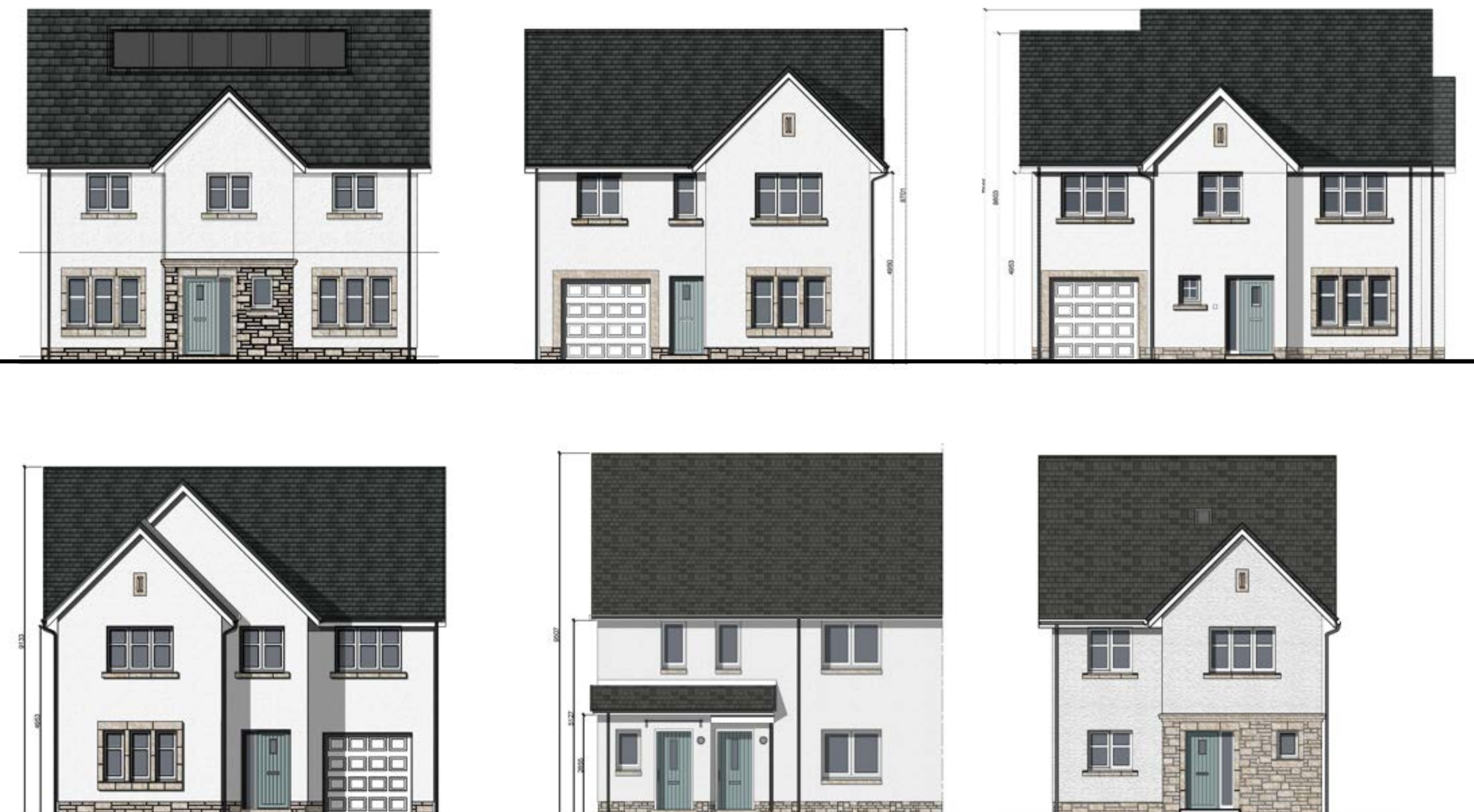
Example of house types