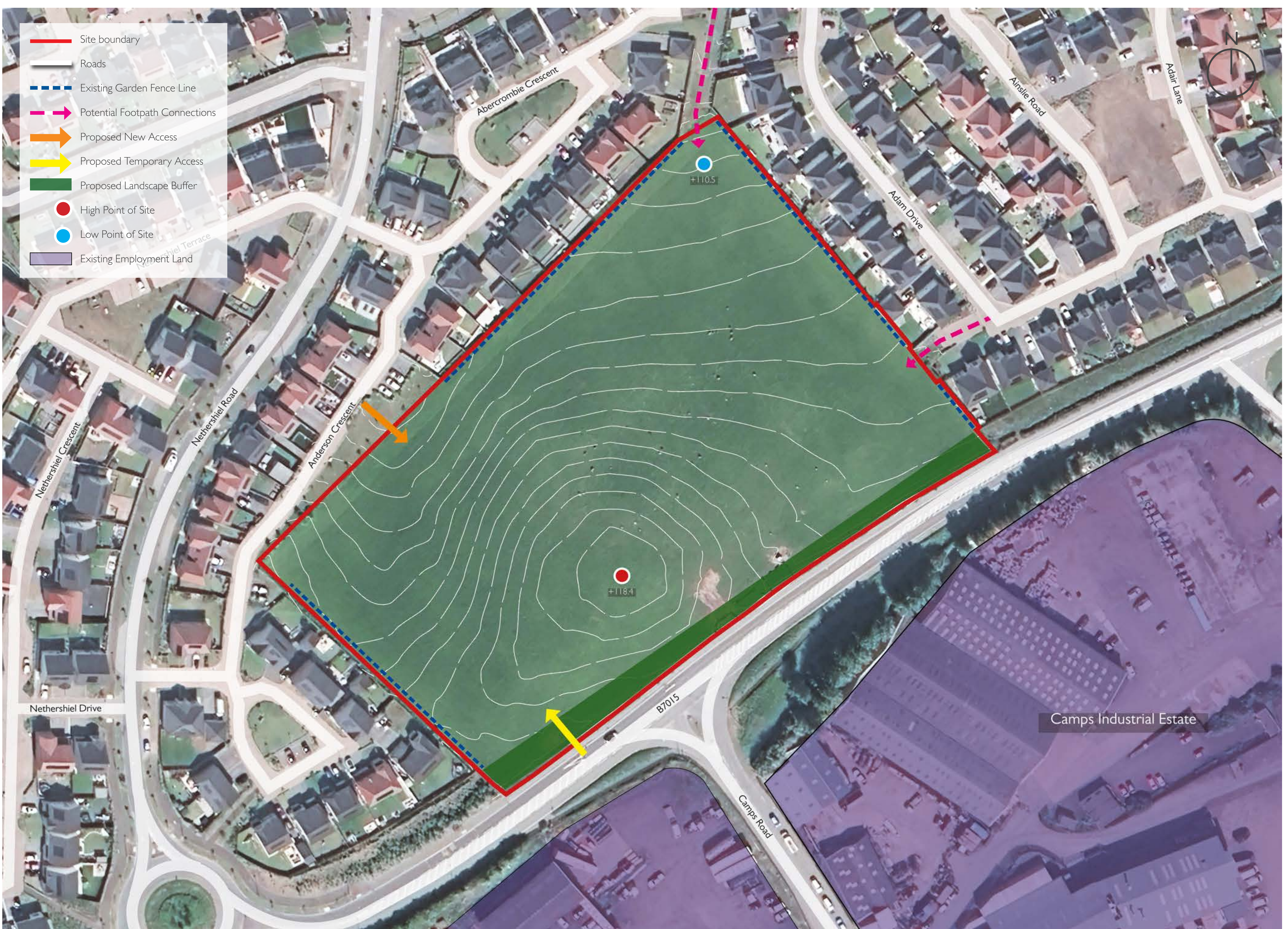
Site Opportunities & Constraints Plan

The site extends to approximately 2.41 hectares, located to the north of the B7015. A number of technical assessments have been carried out and have informed the proposal.