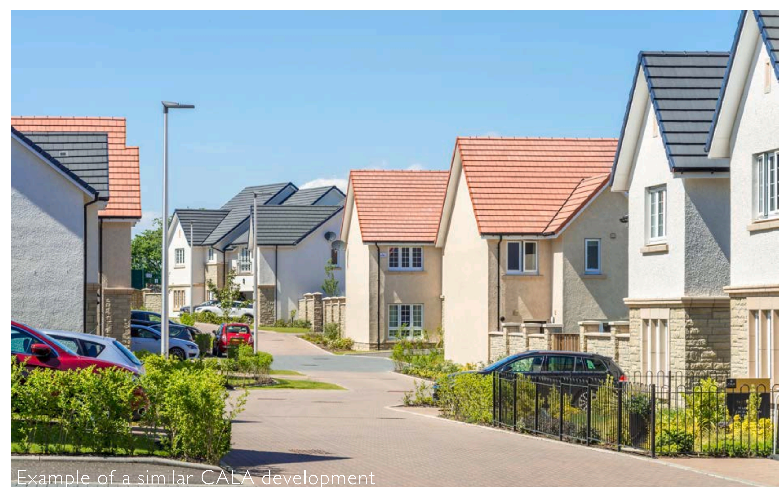
Example of a similar CALA development