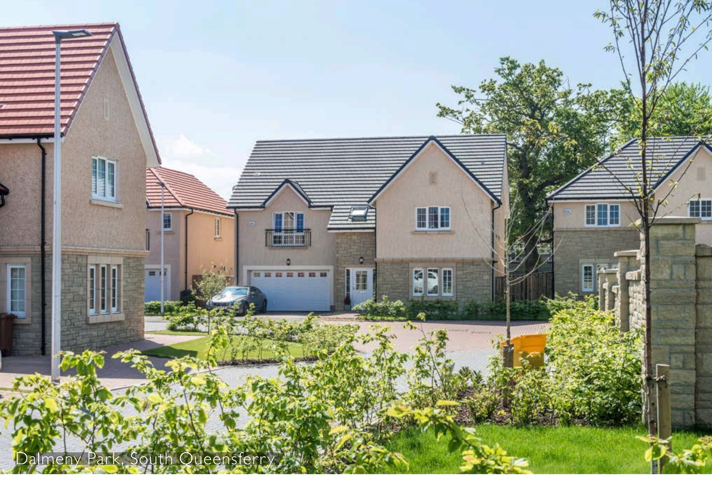
Dalmeny Park, South Queensferry