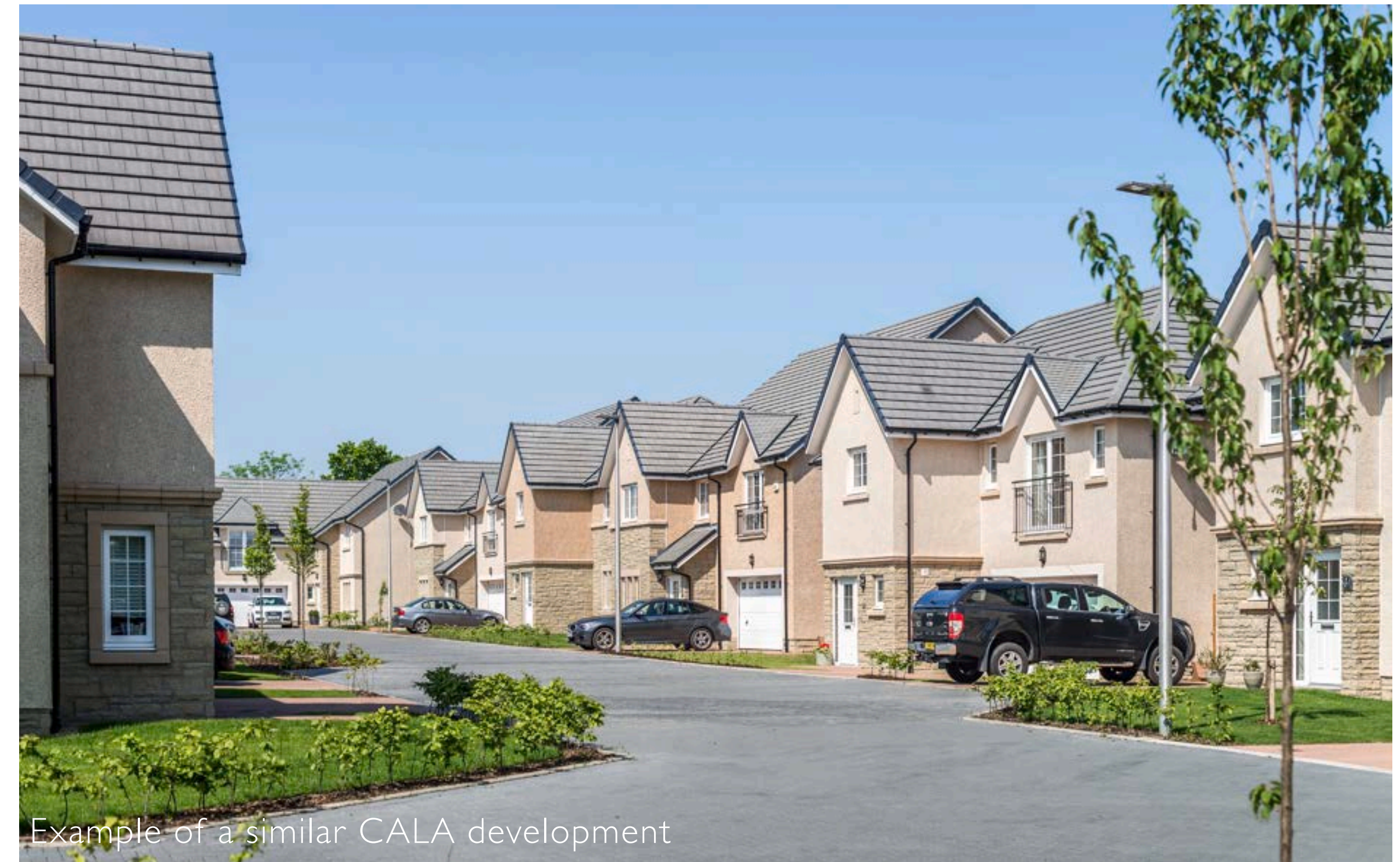
Example of a similar CALA development

A range of high quality materials are proposed, such as split-faced stone, render, precast stone cills and concrete roof tiles. The development is carefully considered to create safe and welcoming streets and spaces, and homes that will support a modern lifestyle. The proposals will bring value to the local area, building a strong community for future generations.