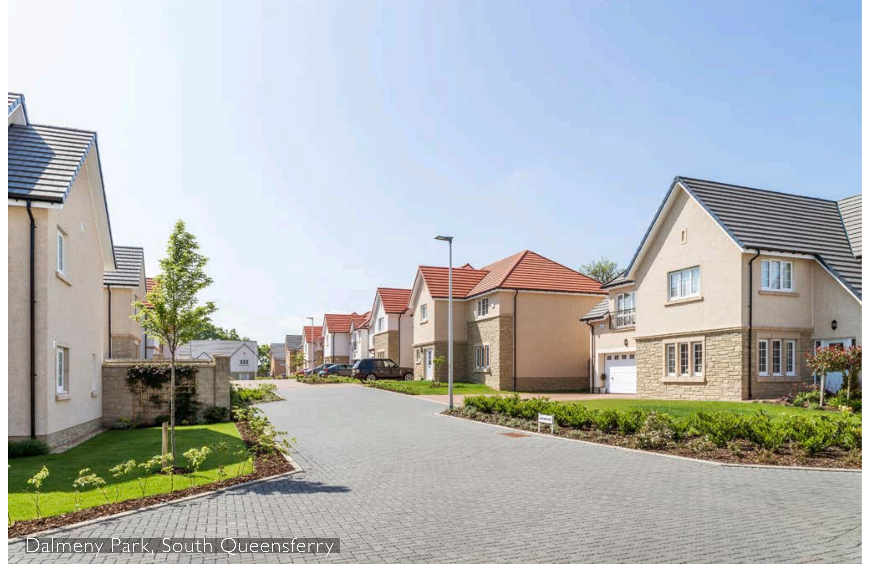
Dalmeny Park, South Queensferry