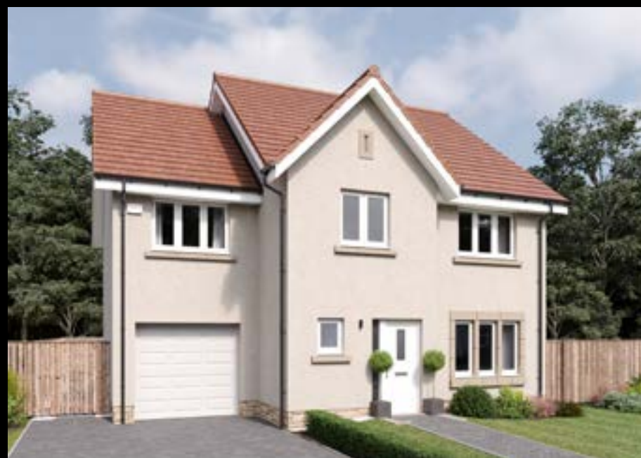
The Bryce 4 bedroom detached home