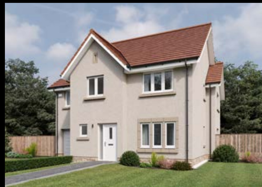
The Cairn 4 bedroom detached home