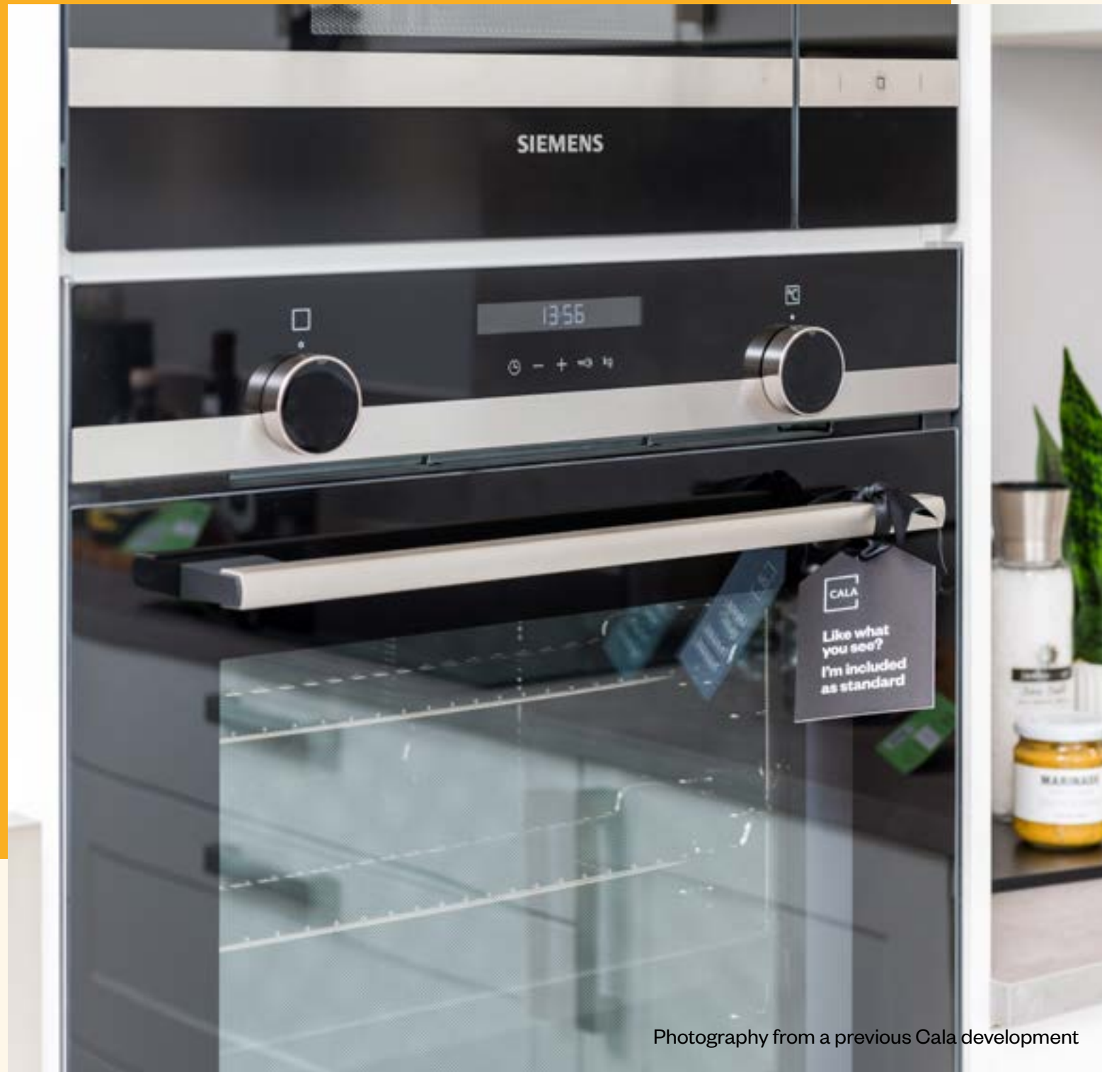
Photography from a previous Cala development