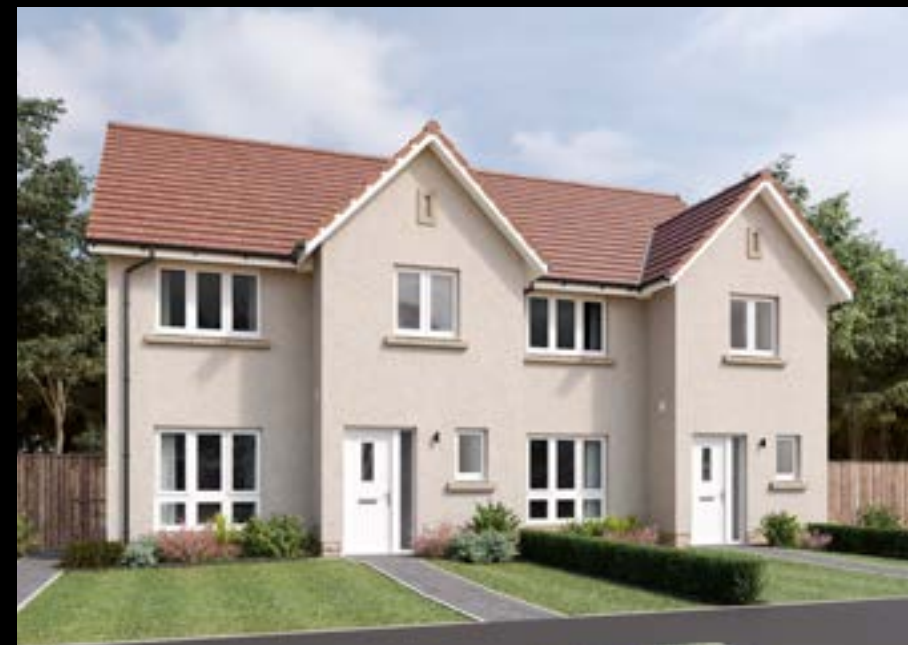
The Banton 3 bedroom terraced home