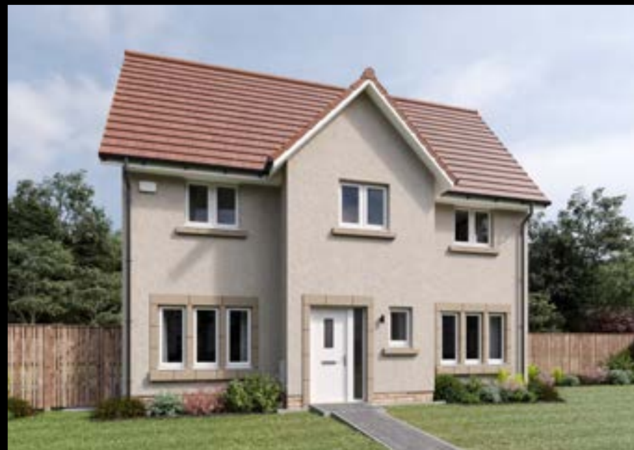
The Arran 3 bedroom terraced home