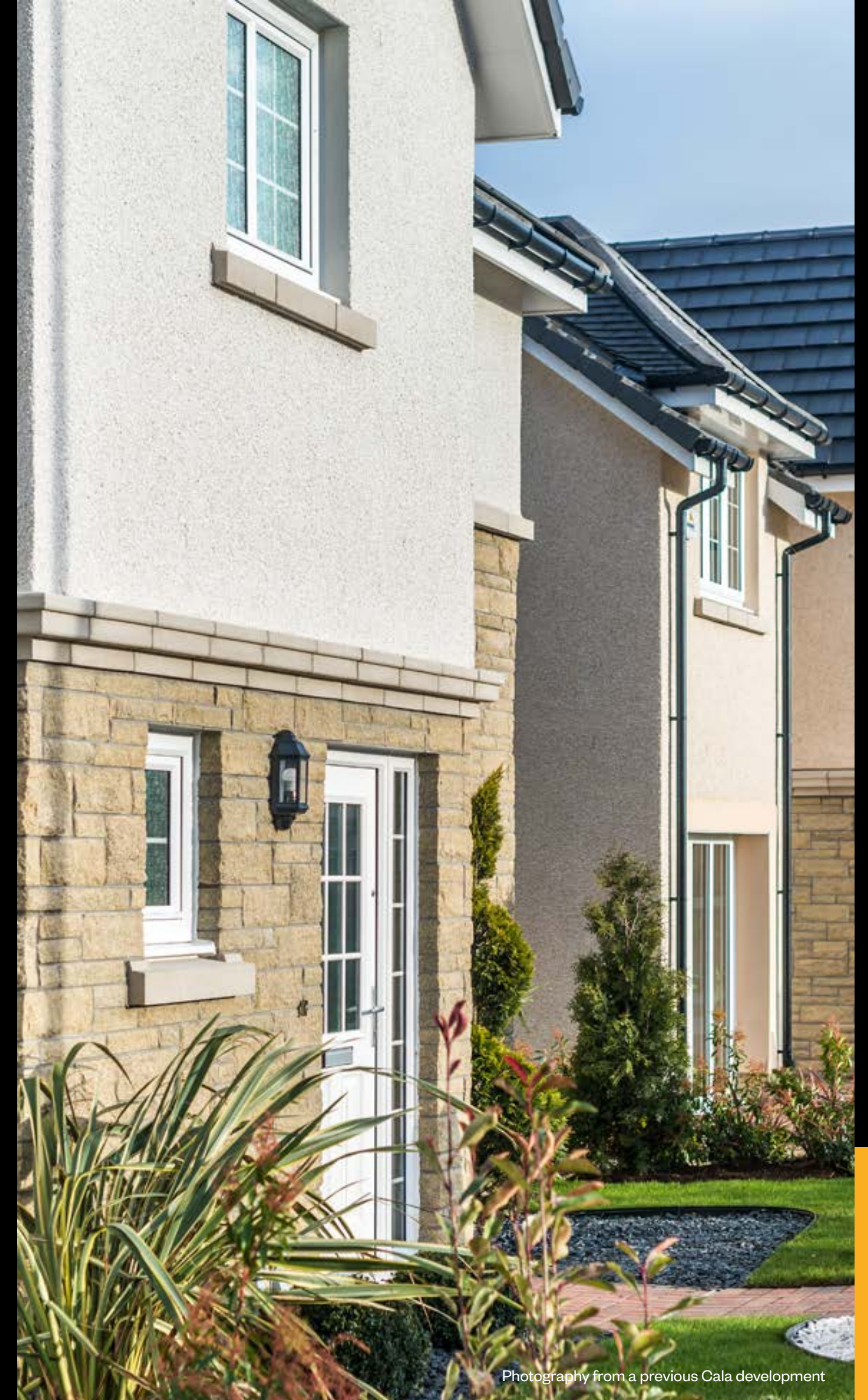
Photography from a previous Cala development