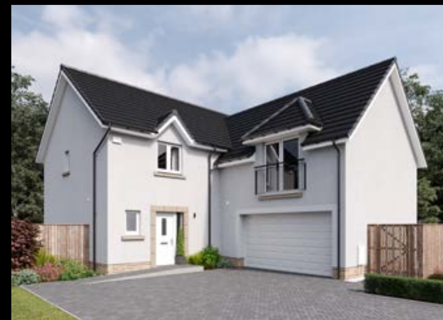
The Dewar 5 bedroom detached home