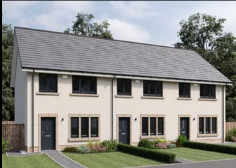
The Allan 3 bedroom terraced home