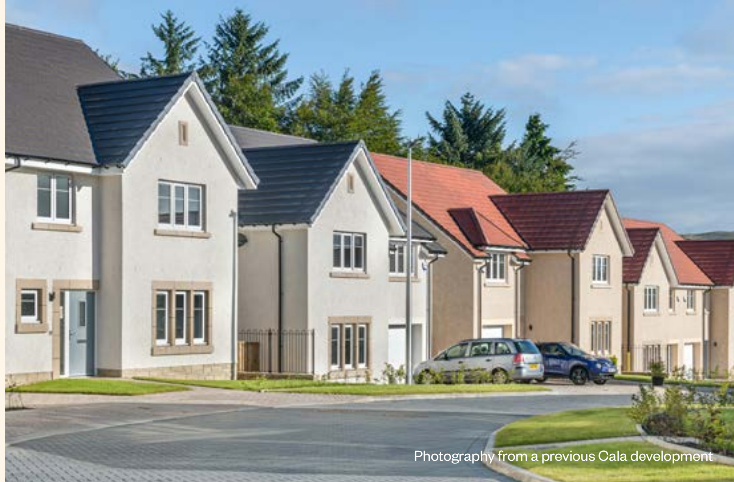
Photography from a previous Cala development