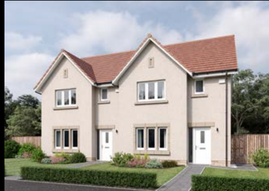
The Avon 3 bedroom terraced home