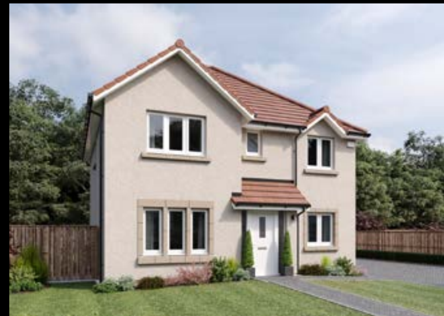
The Blair 4 bedroom detached home