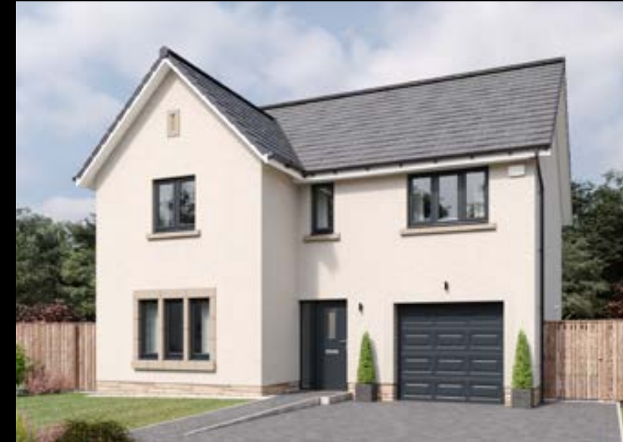
The Barrie 4 bedroom detached home