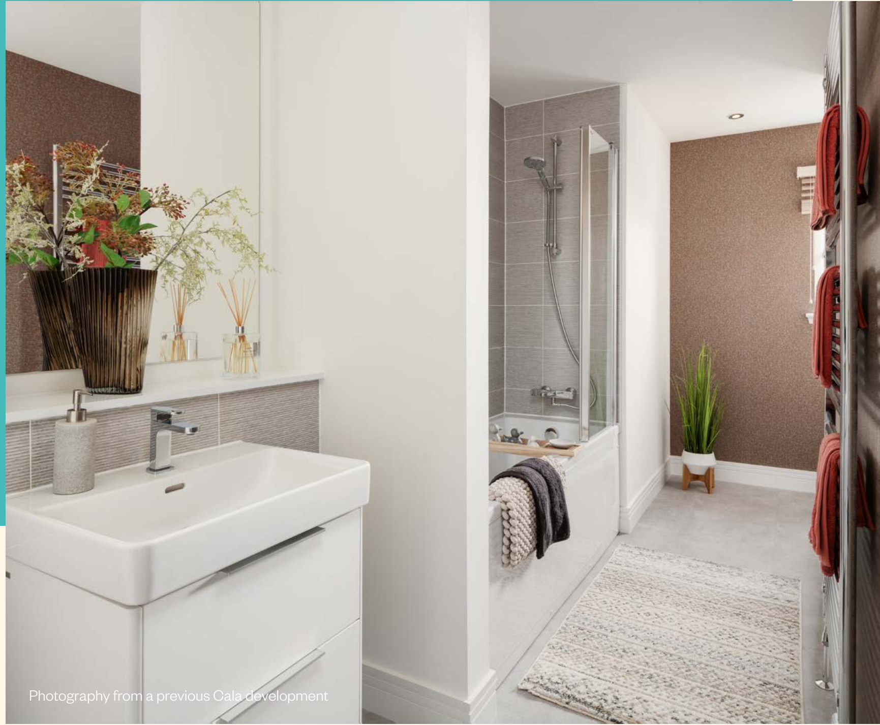
Photography from a previous Cala development