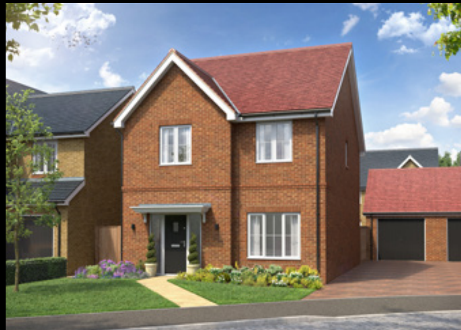
The Larfield 4 bedroom detached home with garage