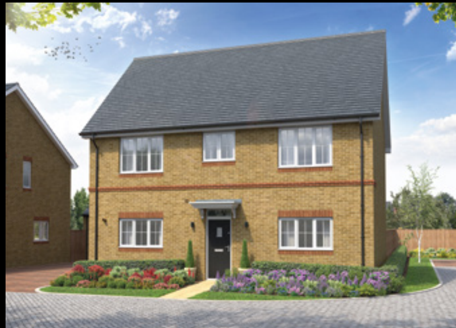
The Lenham 4 bedroom detached home with garage