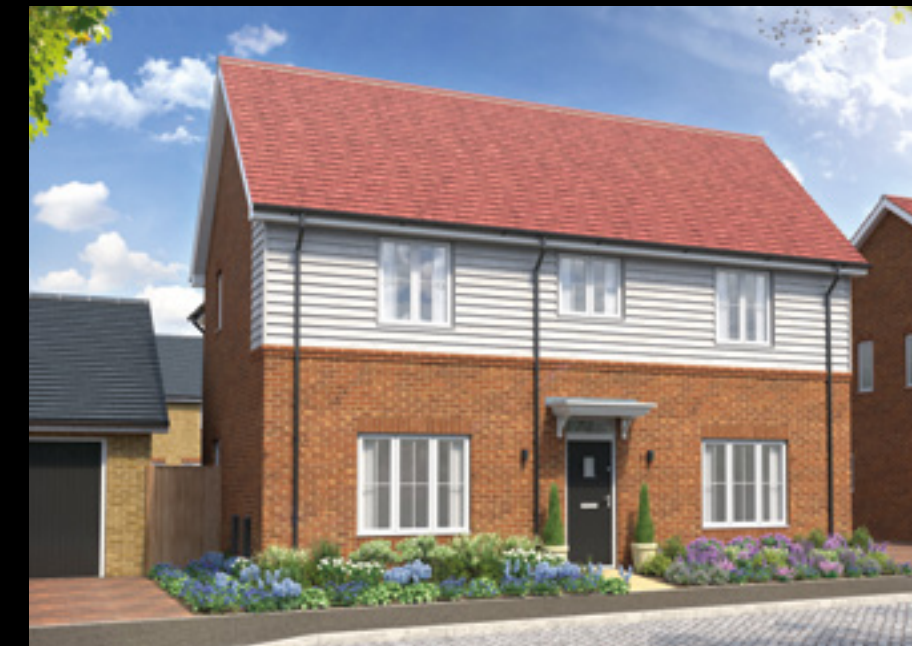
The Nessfield 4 bedroom detached home with garage

Click here for current availability and prices