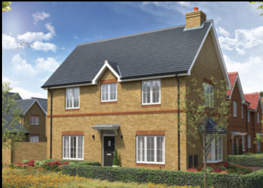
The Lanmead 4 bedroom detached home with integral garage