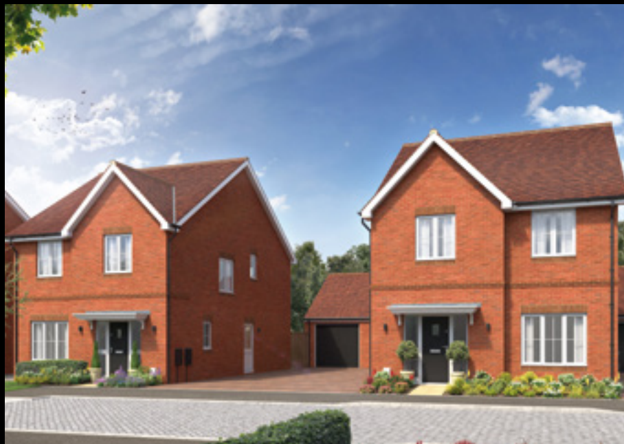
The Kinfield 4 bedroom detached home with garage