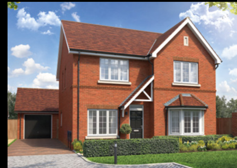
The Nenhurst 4 bedroom detached home with garage