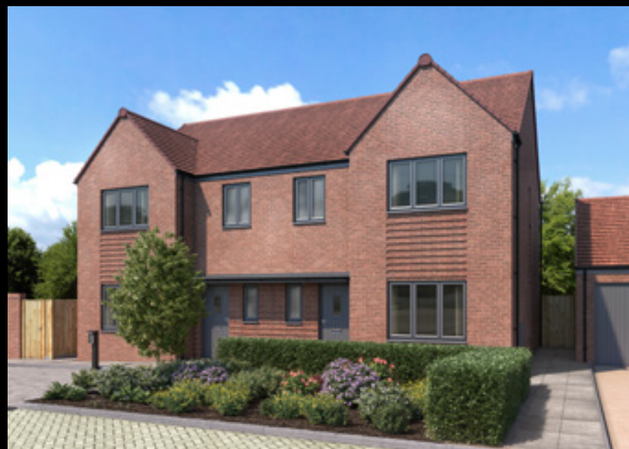
The Fir 3 bedroom semi-detached/ detached home