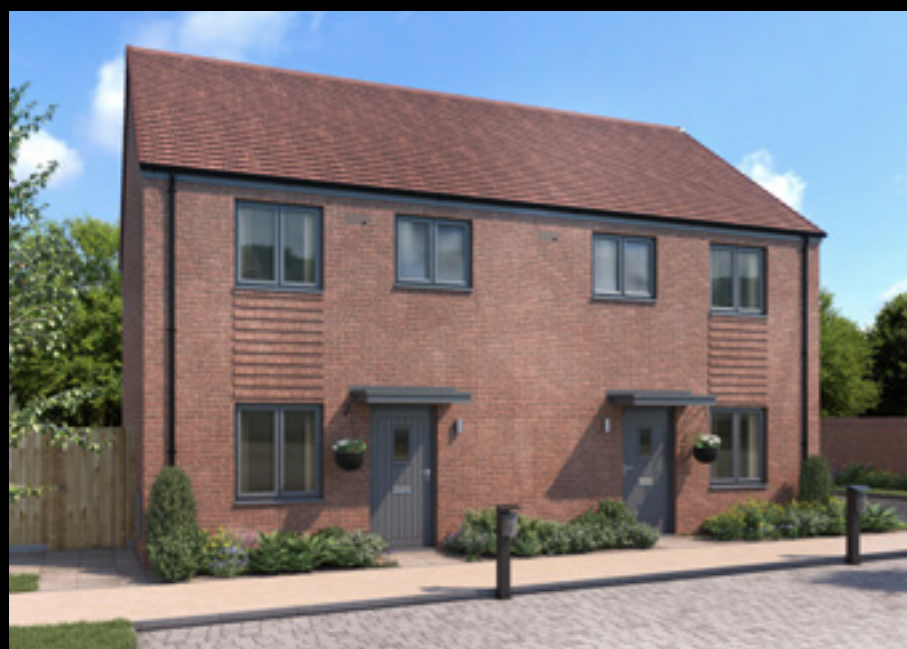
The Bayberry 2 bedroom semi-detached/ terraced home