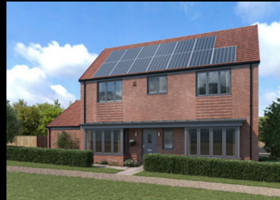
The Rowan 4 bedroom detached home