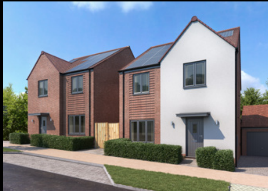
The Laurel 4 bedroom detached home