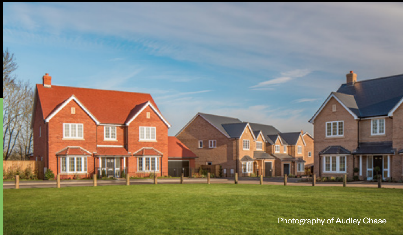
Photography of Audley Chase