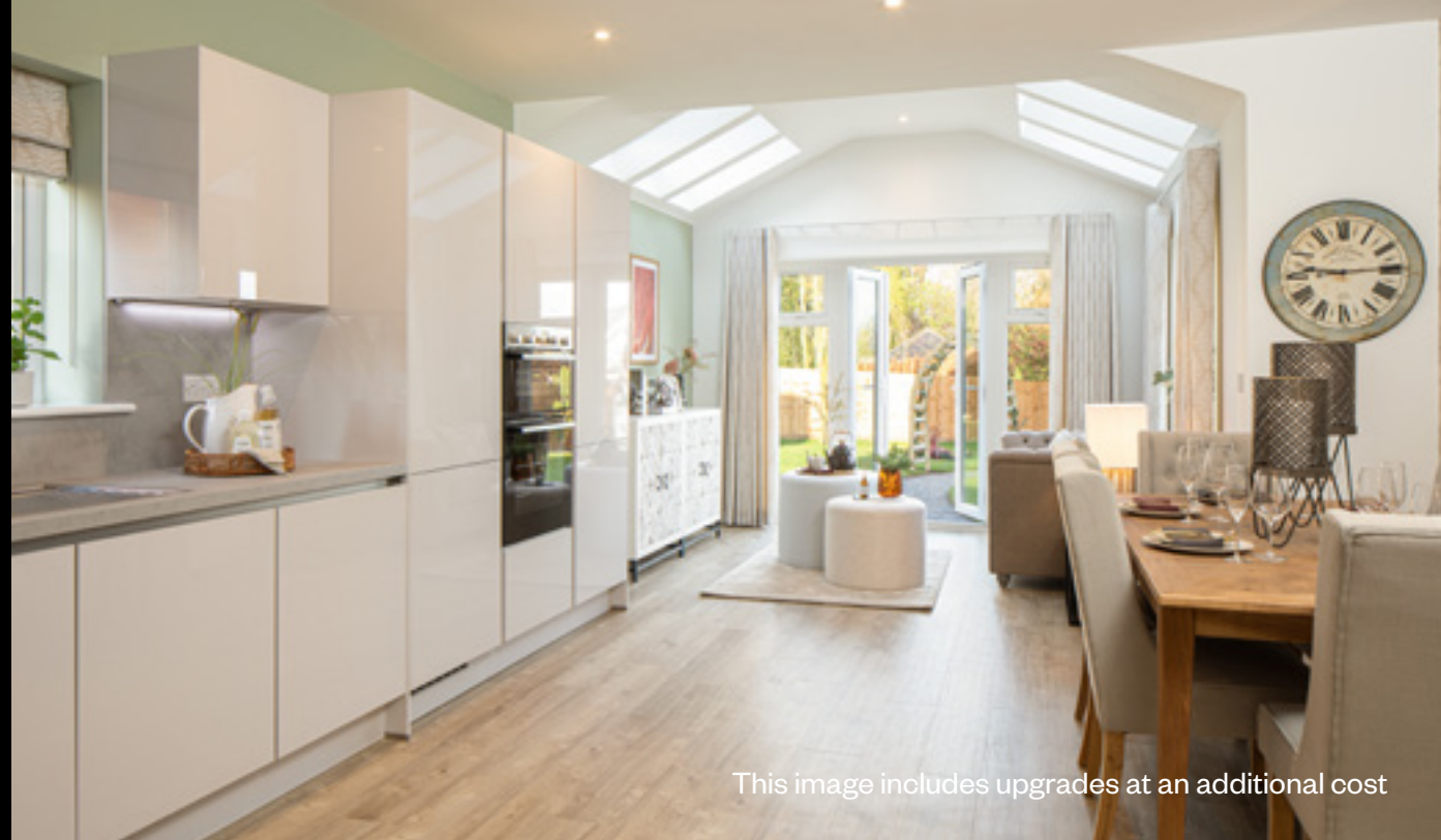
This image includes upgrades at an additional cost