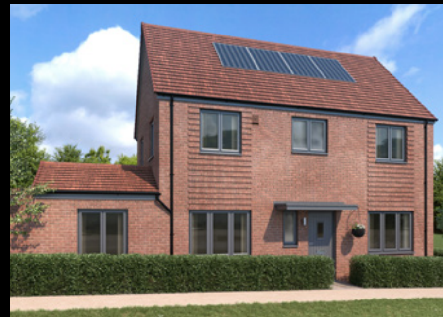
The Everglade 3 bedroom detached home

Click here for current availability and prices