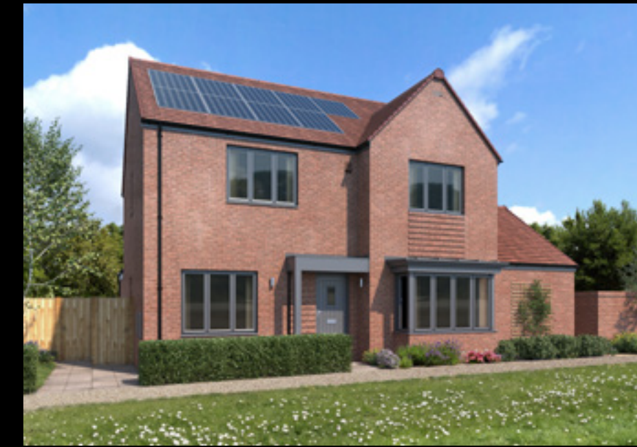
The Pecan 4 bedroom detached home