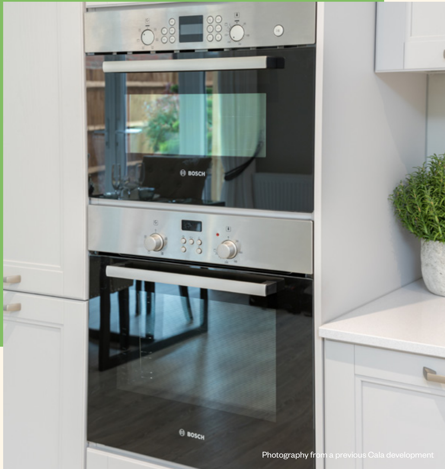
Photography from a previous Cala development