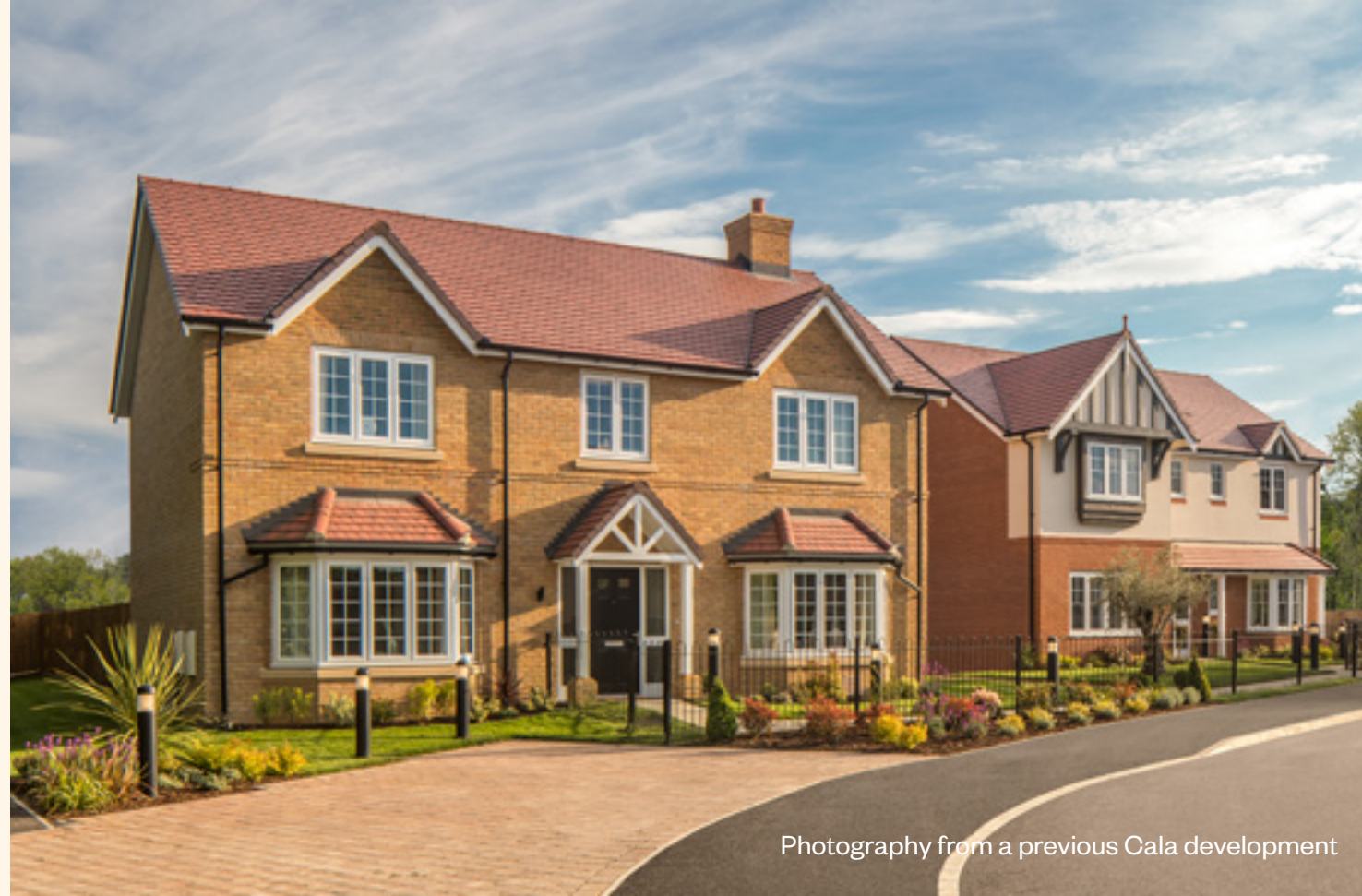
Photography from a previous Cala development