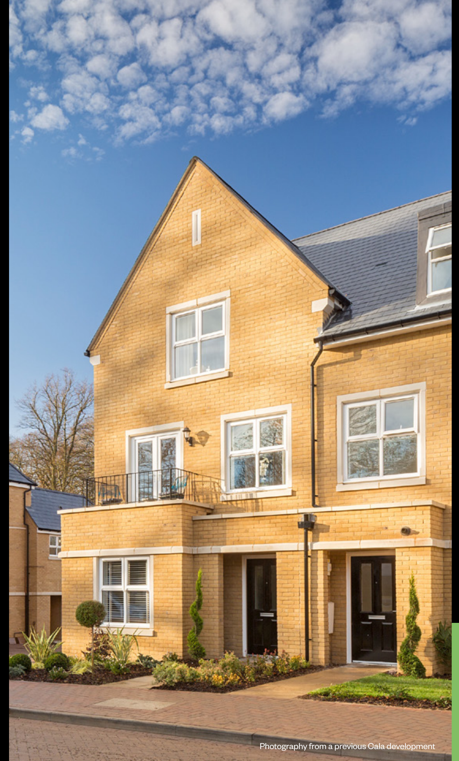
Photography from a previous Cala development