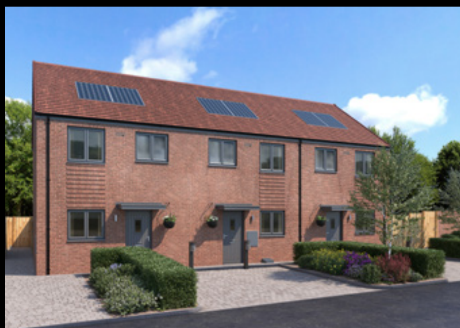
The Alder 2 bedroom terraced home