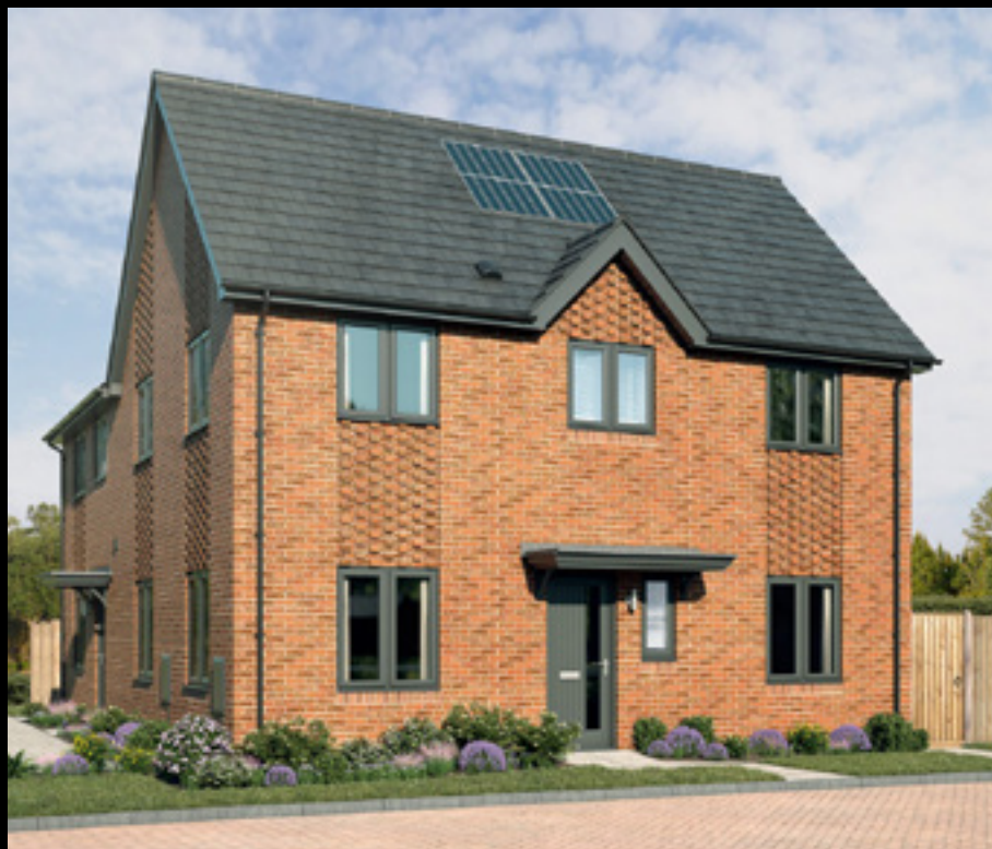
The Chestnut 3 bedroom semi-detached home