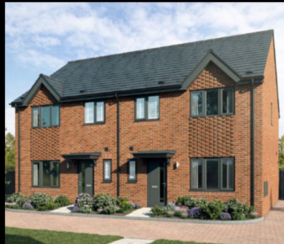
The Blackthorn 3 bedroom semi-detached home