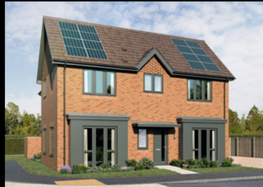
The Silverbell 4 bedroom detached home