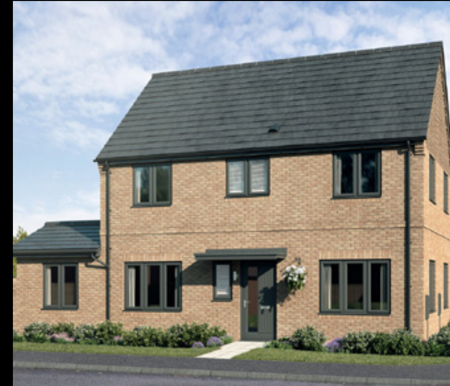
The Everglade 3 bedroom detached home