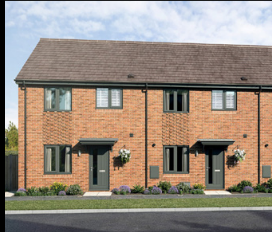
The Aspen 2 bedroom terraced and semi-detached home