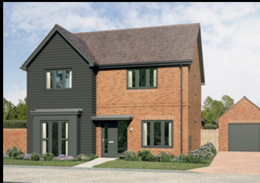
The Rockrose 4 bedroom detached home