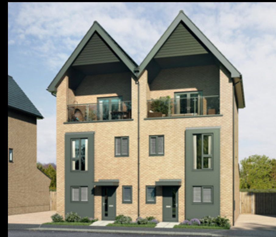
The Acton 3 bedroom semi-detached home