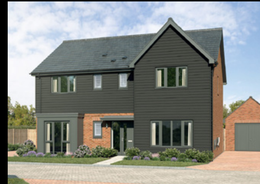
The Samphire 4 bedroom detached home