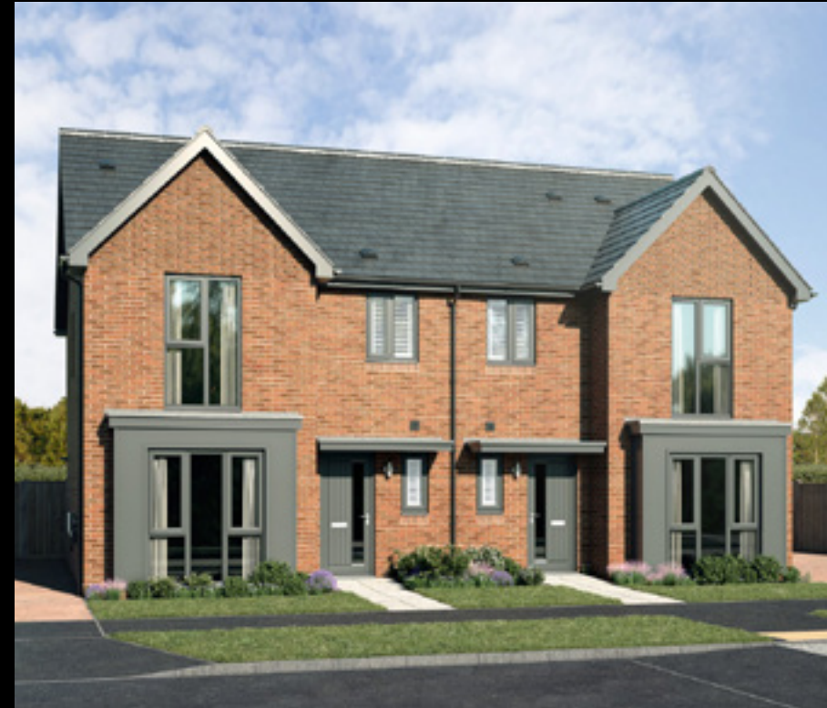
The Fir 3 bedroom semi-detached home