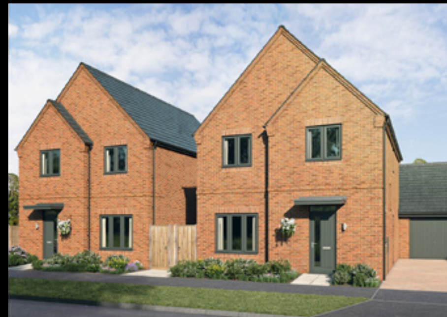
The Laurel 4 bedroom detached home