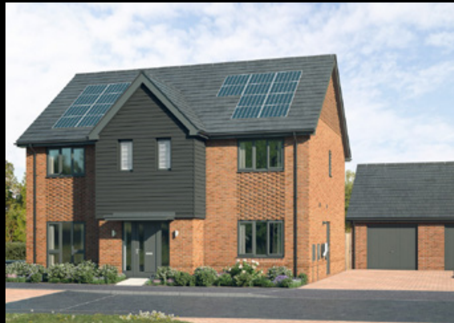
The Spruce 5 bedroom detached home