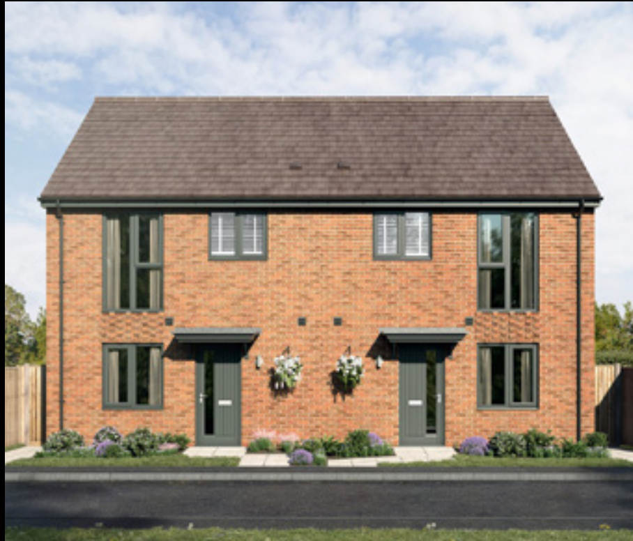
The Bayberry 2 bedroom semi-detached home