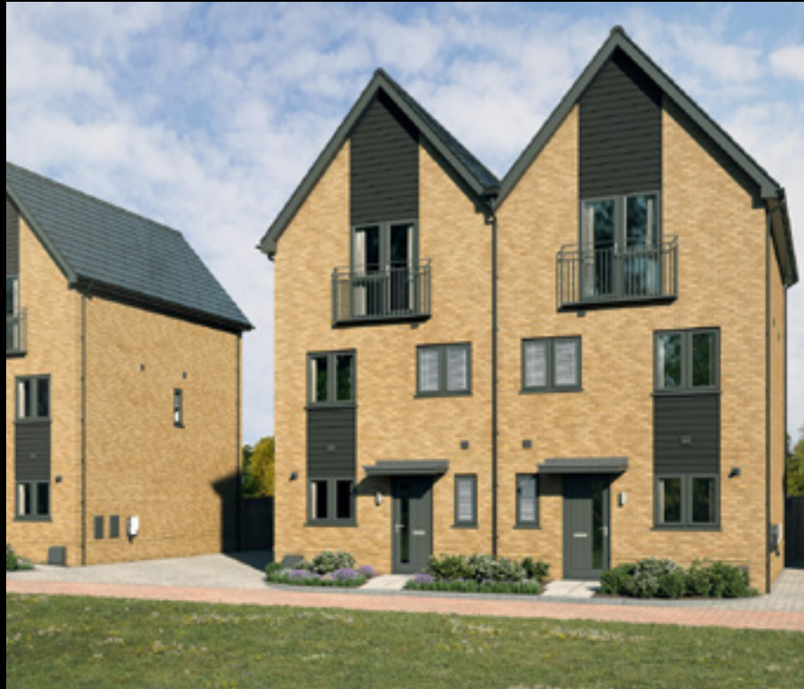
The Ivy 3 bedroom semi-detached home