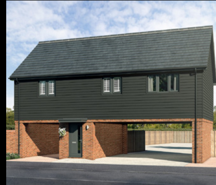
The Birch 2 bedroom coach home