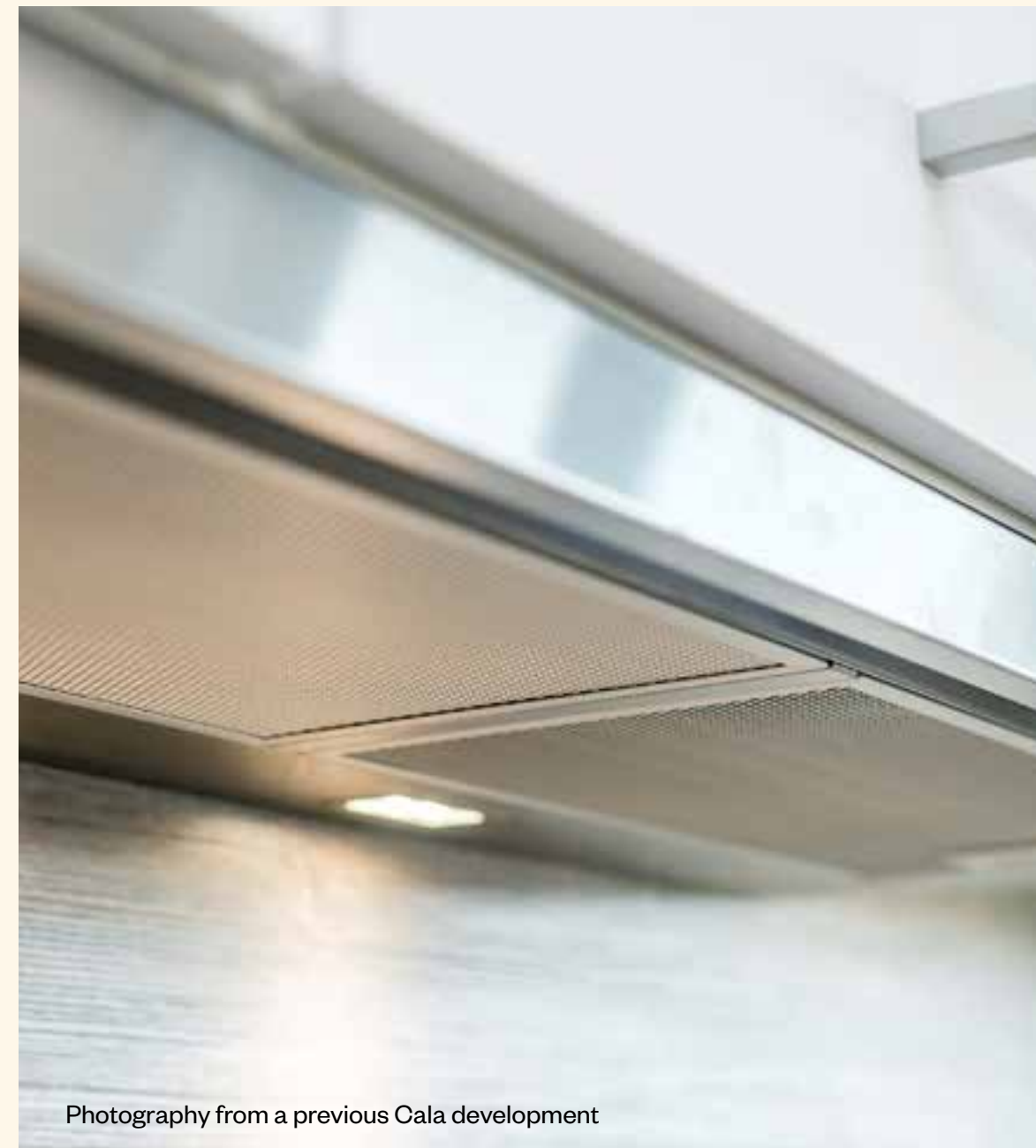
Photography from a previous Cala development