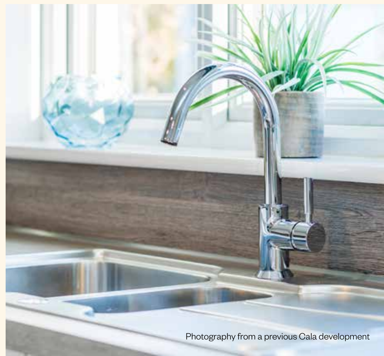
Photography from a previous Cala development