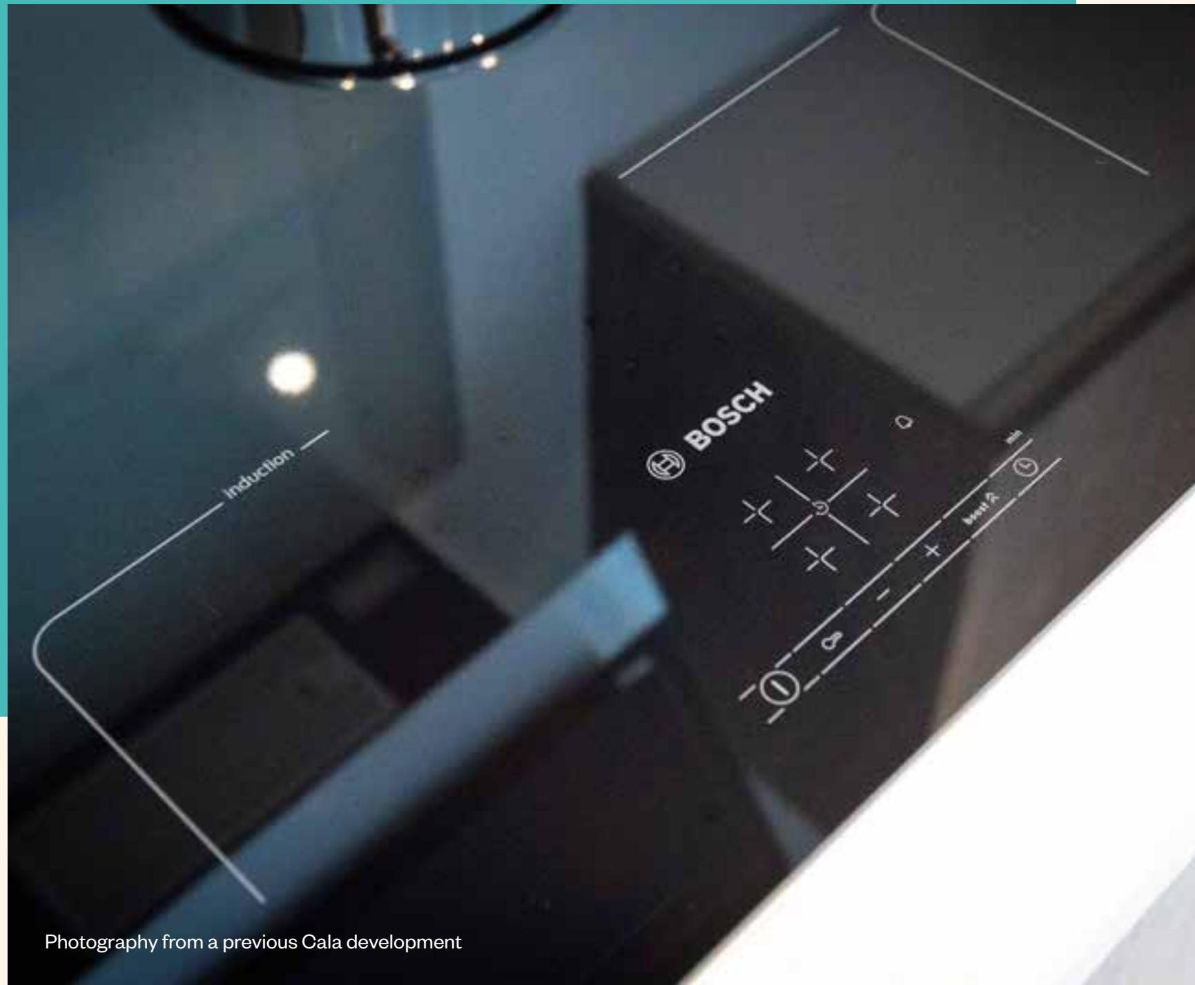
Photography from a previous Cala development