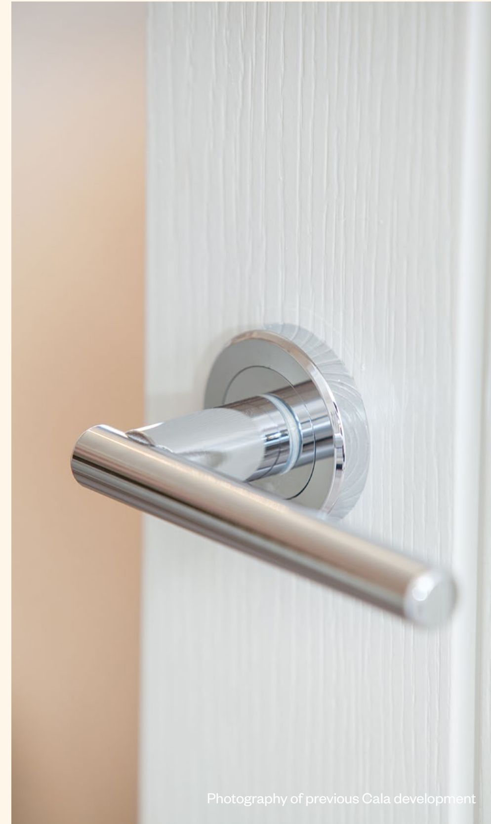
Photography of previous Cala development