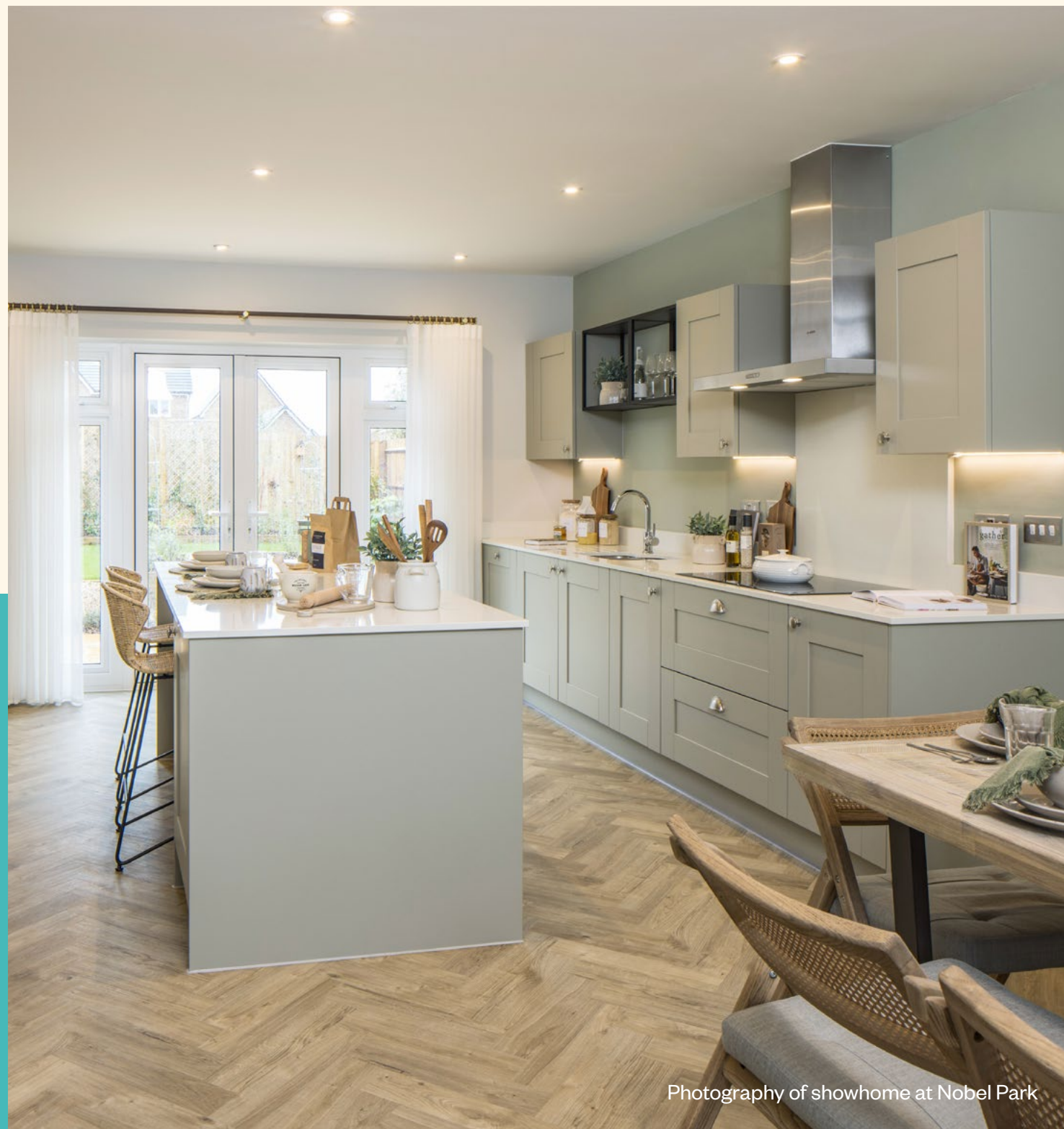
Photography of showhome at Nobel Park