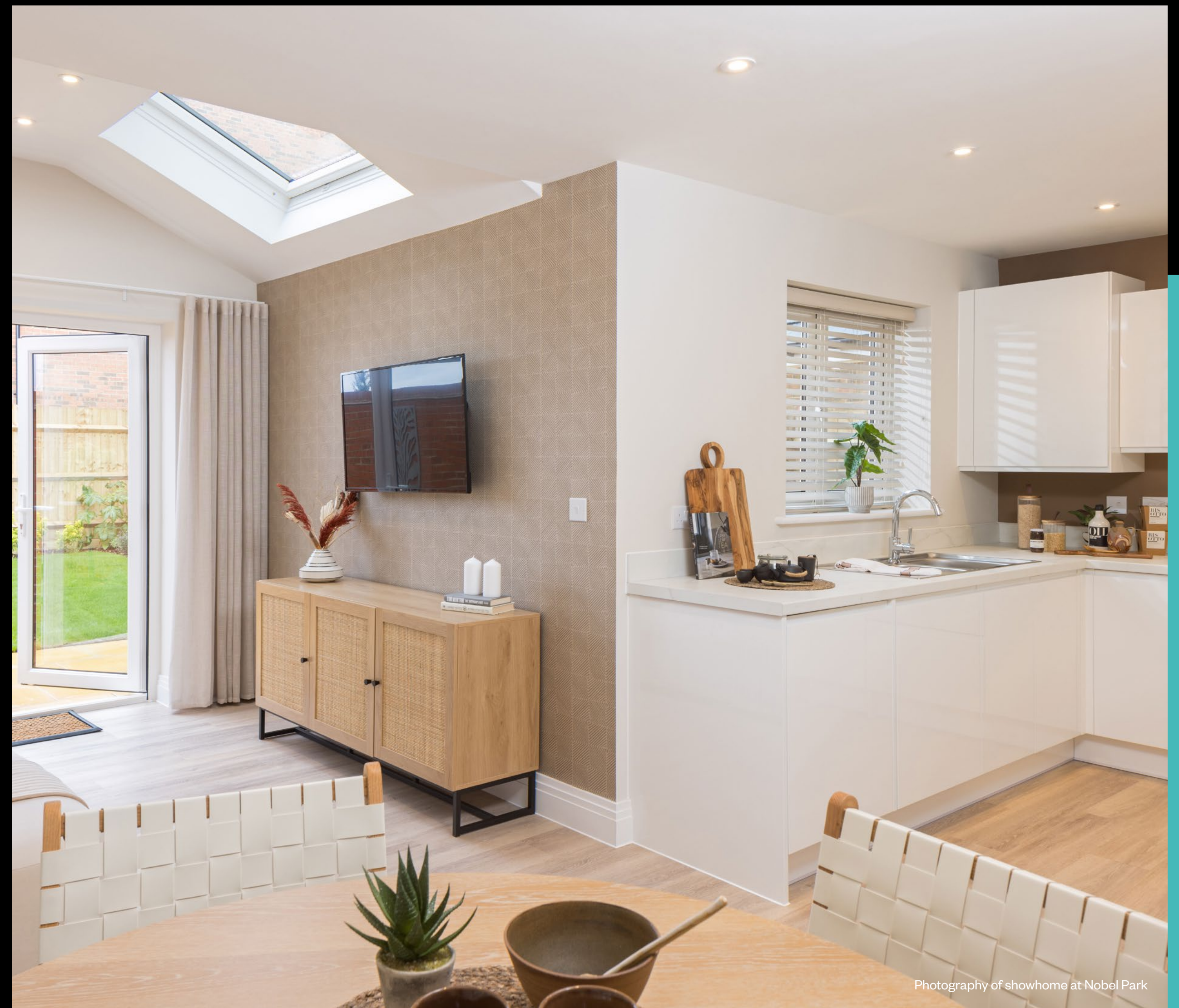
Photography of showhome at Nobel Park

Designs that are perfect for everyone, whether you are looking for more space or to downsize, in search of a private garden or simply want a home that's better suited to you. Our homes are flexible for those working from home too and all our four beds offer a separate private study. This could be everything you're looking for in your new home.