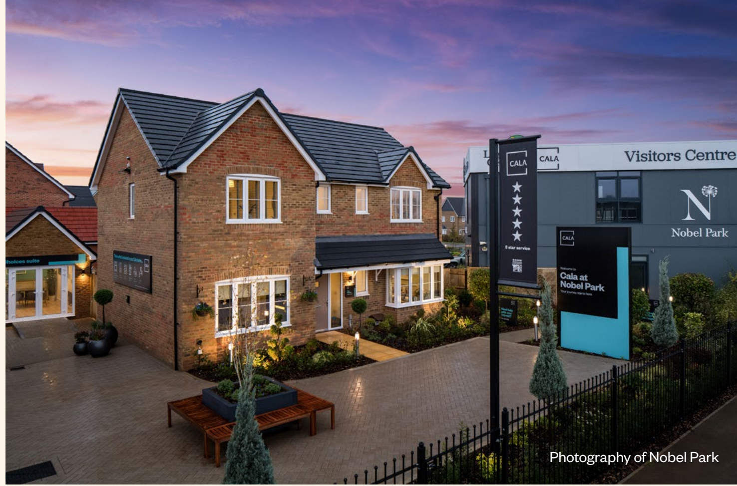
Photography of Nobel Park