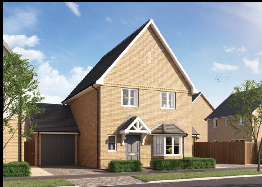
The Drayton 3 bedroom detached and link-detached home