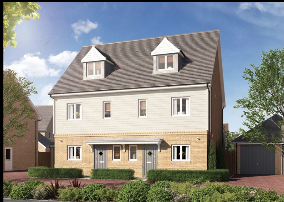
The Ashford 3 bedroom semi-detached home