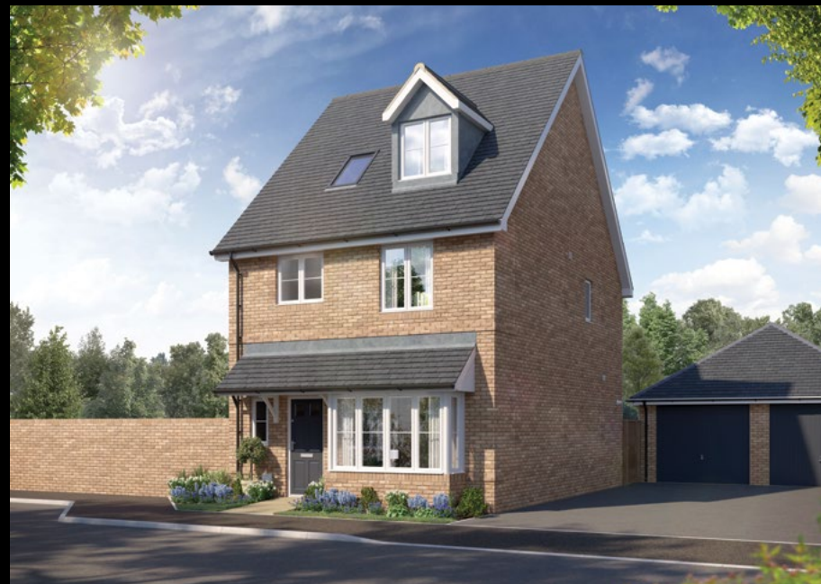
The Mulberry 4 bedroom detached home with study