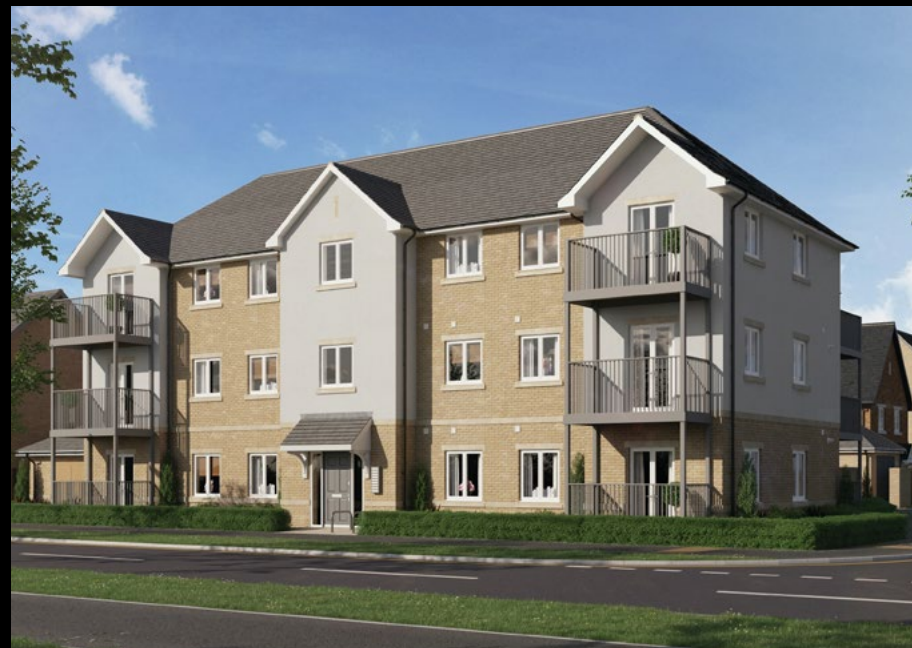
The Hansen 1 & 2 bedroom apartments