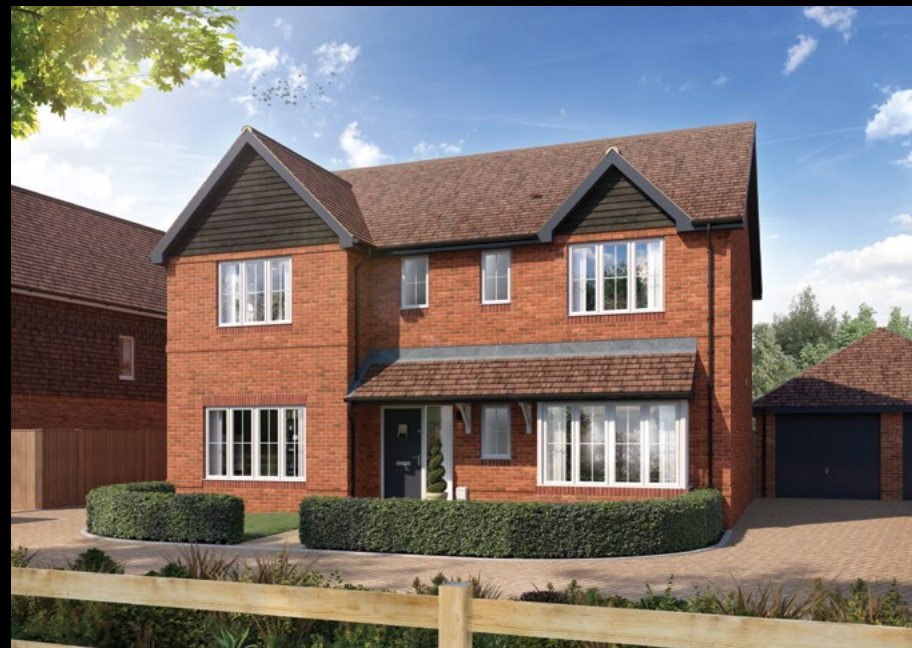
The Walnut 4 bedroom detached home with study