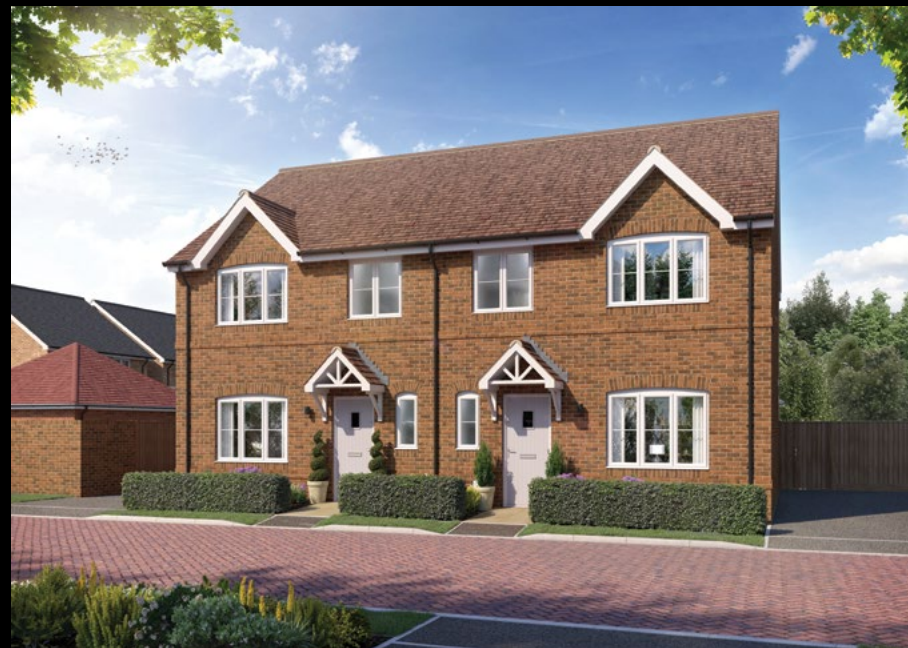
The Blackthorn 3 bedroom detached and semi- detached home