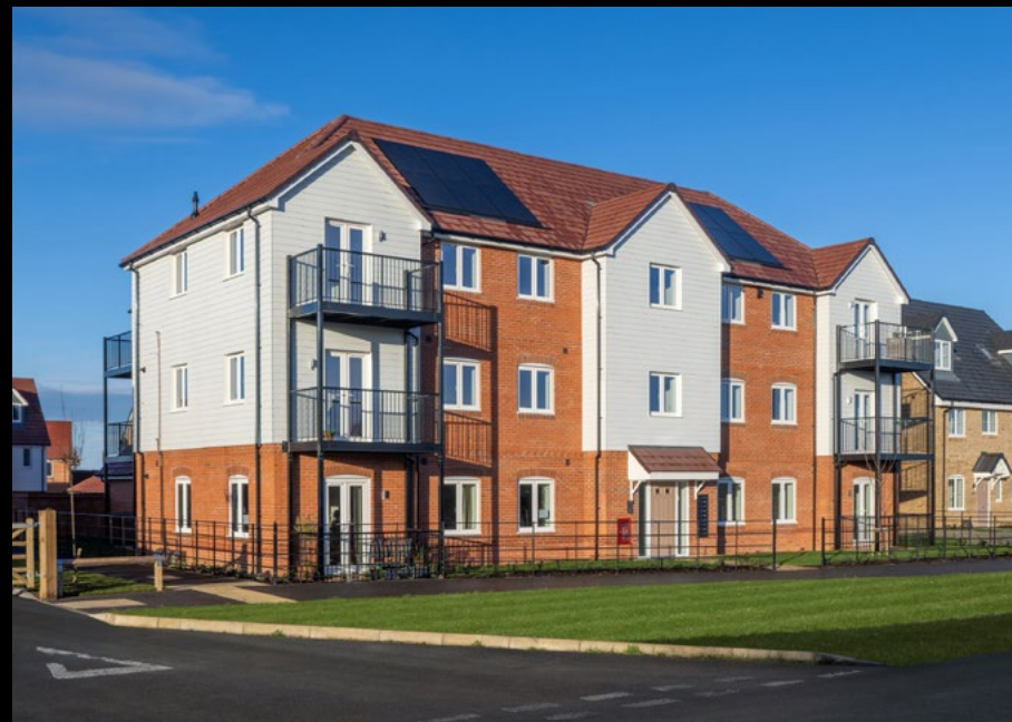
The Maryland 1 & 2 bedroom apartments