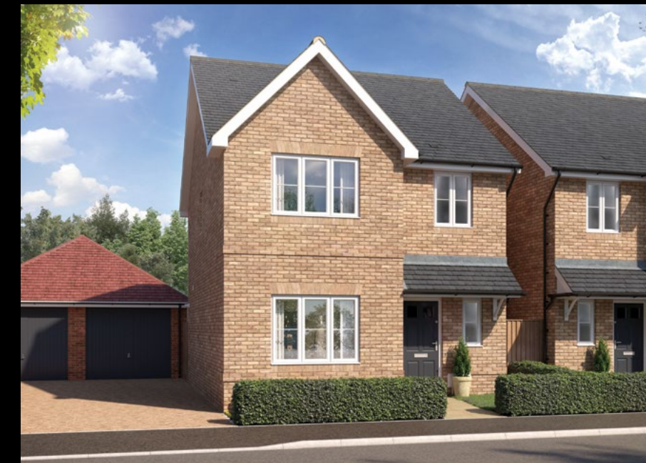
The Fir 3 bedroom detached home

Computer generated images are for illustration purposes only, plot specific elevations and finishes may vary