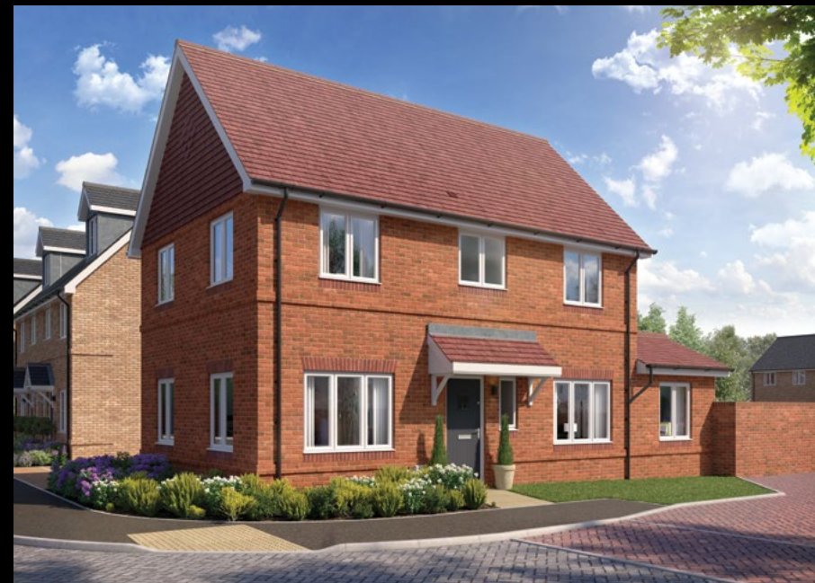
The Everglade 3 bedroom detached home