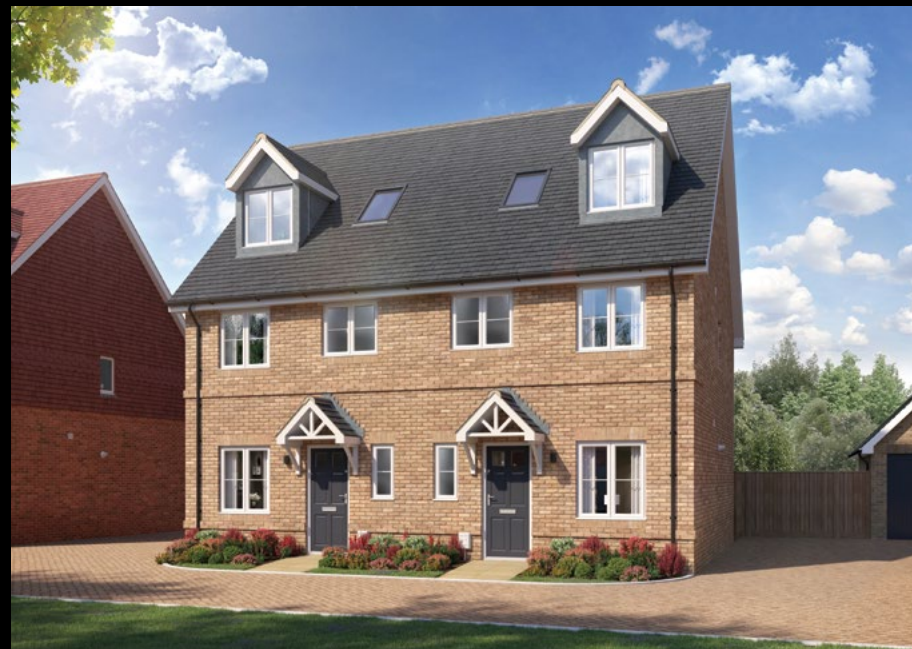
The Elder 3 bedroom semi-detached home