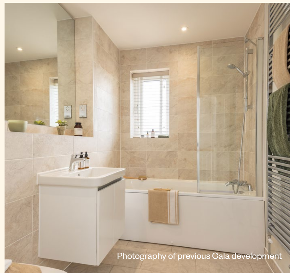
Photography of previous Cala development

With every home comfort considered for energy-efficient and low maintenance living, each aspect of your family home is beautifully designed and built to an exacting standard; because when you look for quality, it's the little things that make all the difference.