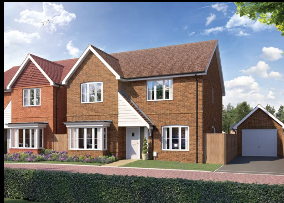
The Poplar 4 bedroom detached home with study