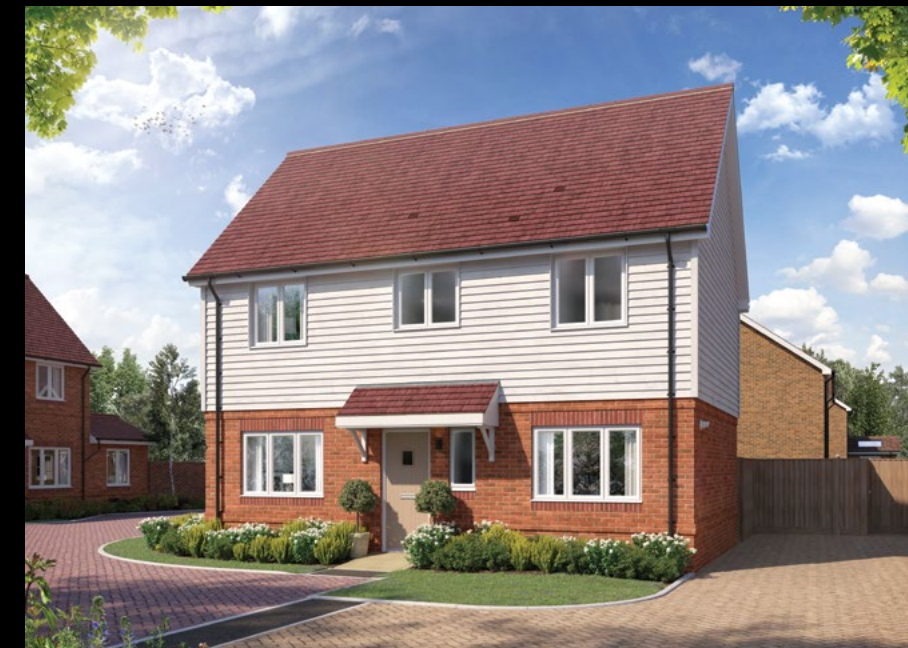
The Cedar 3 bedroom detached home