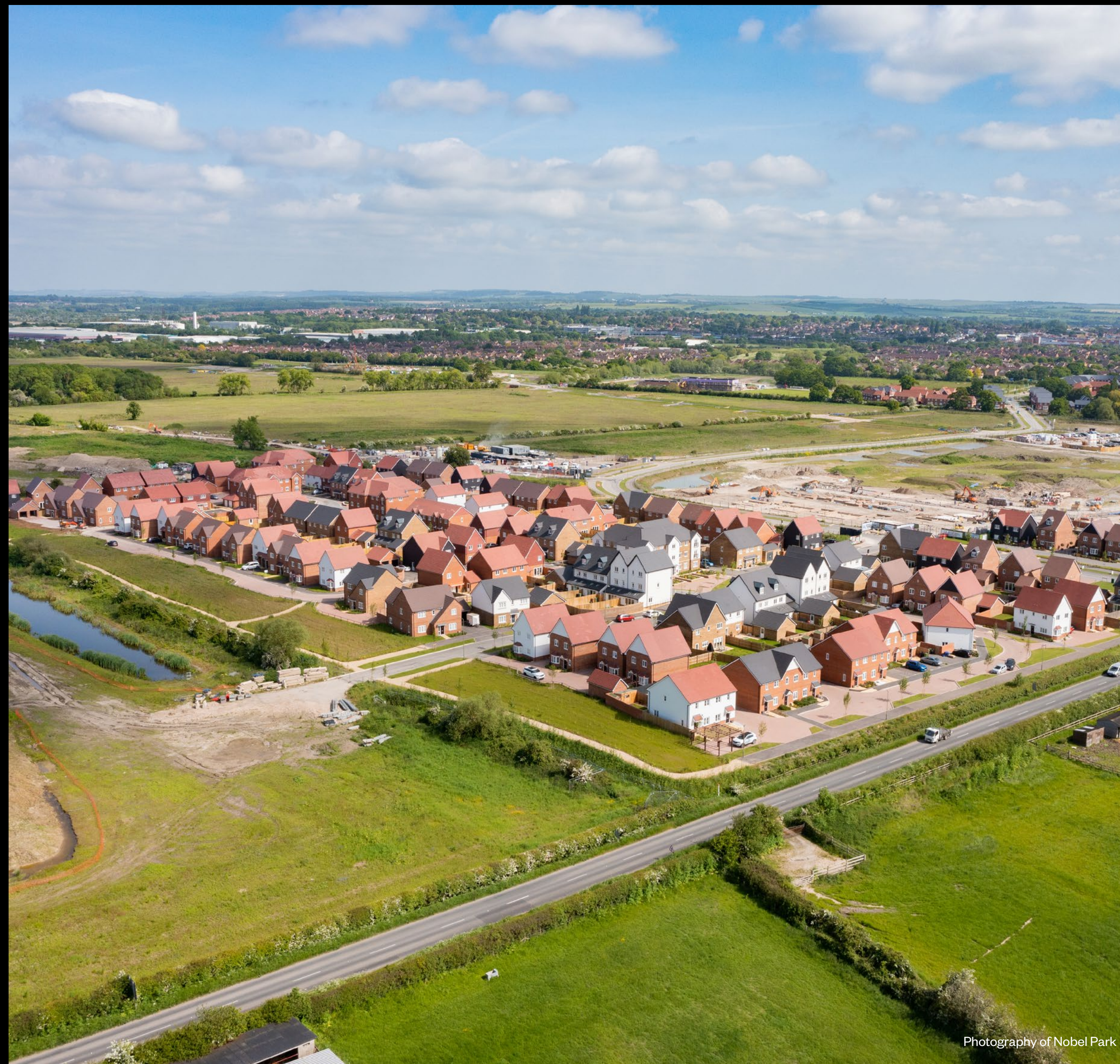
Photography of Nobel Park

With plans for allotments and a community orchard, playing fields and sports grounds, walking trails and cycle paths, a haven for flora and fauna and hedgehog runs – a breath of fresh air for you, your family and your natural neighbours.