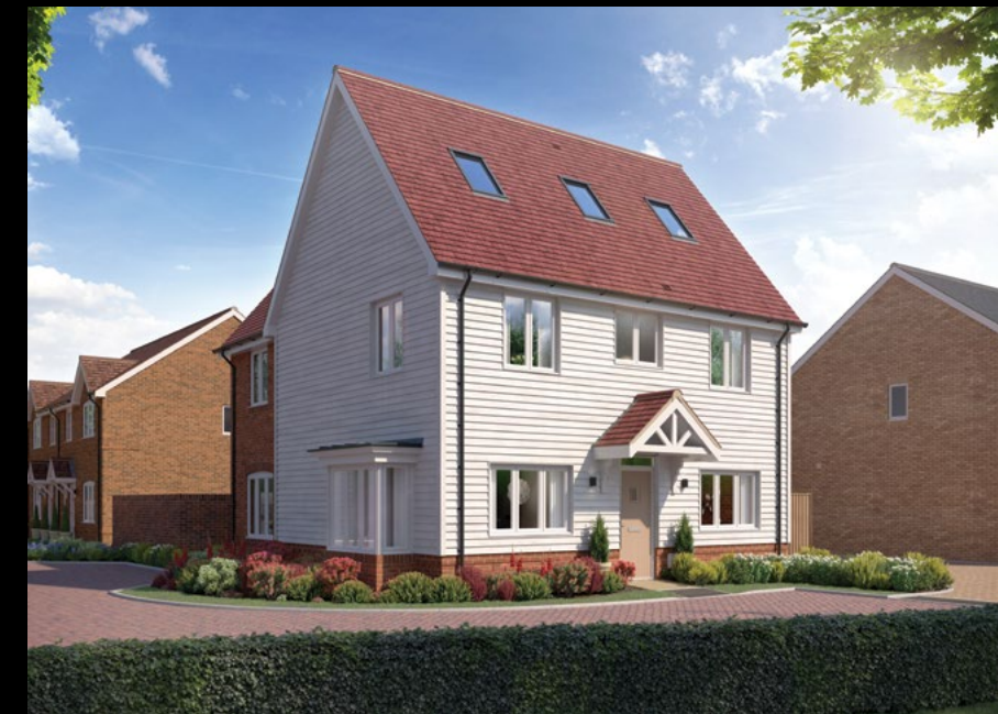
The Twinberry 4 bedroom detached home with study