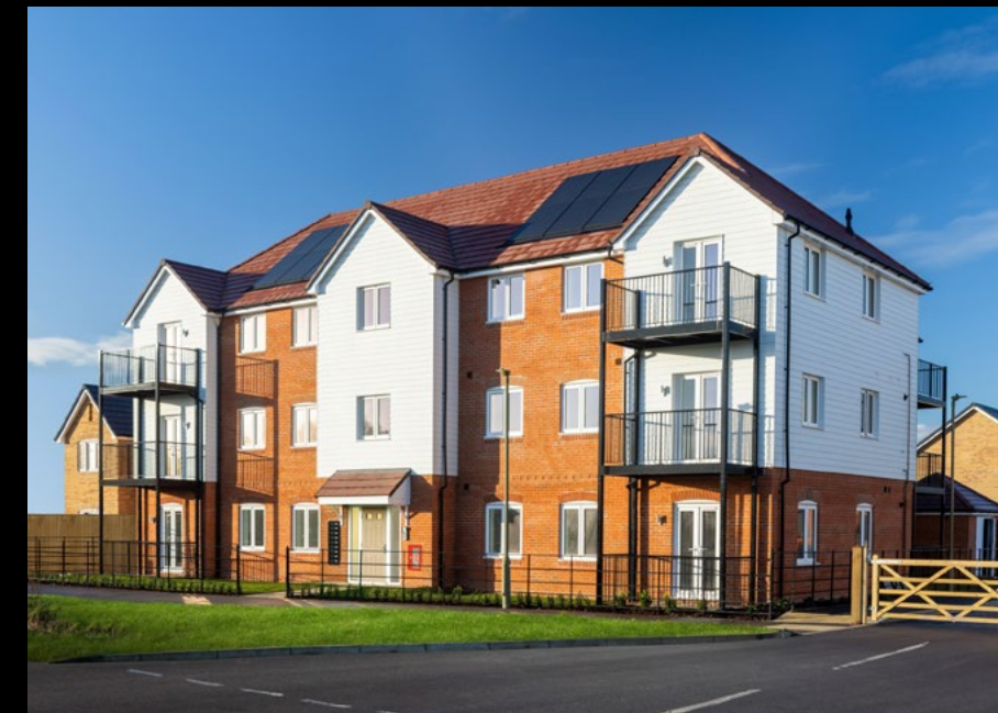
The Fosse 1 & 2 bedroom apartments